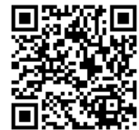
A La Carte Menu